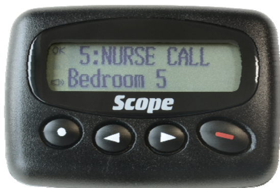
Two-line zoom mode gives clear bold text for quick, easy reading

Four button operation with icon driven menu options make the GEO 28V2 pager quick and easy to use. The four line dot matrix screen displays your text in a clear easy to read format. Add to this a compact ergonomic case design and USB charging and you have a classic pager suitable for most paging applications